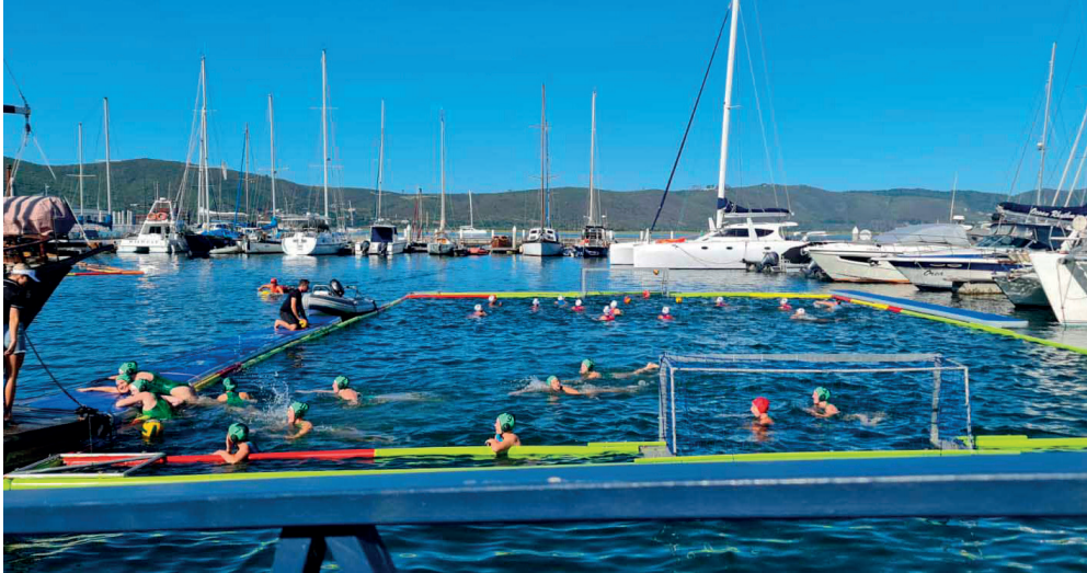
We sent teams to compete in the Oakhill Waterpolo Festival which took place in the Knysna harbour in February

2023 has felt like a full return to “normal” levels of sporting activity. Many of our teams have been able to take part in tours, tournaments and sporting festivals. This has made a huge difference to the morale of teams and we are seeing signs of recovery in our results. Among other encouraging results, the boys’ first waterpolo team triumphed in a fiercely contested final to win the B league, and our boys’ first hockey team is currently unbeaten in their league this season, scoring 20 goals and conceding only 1.